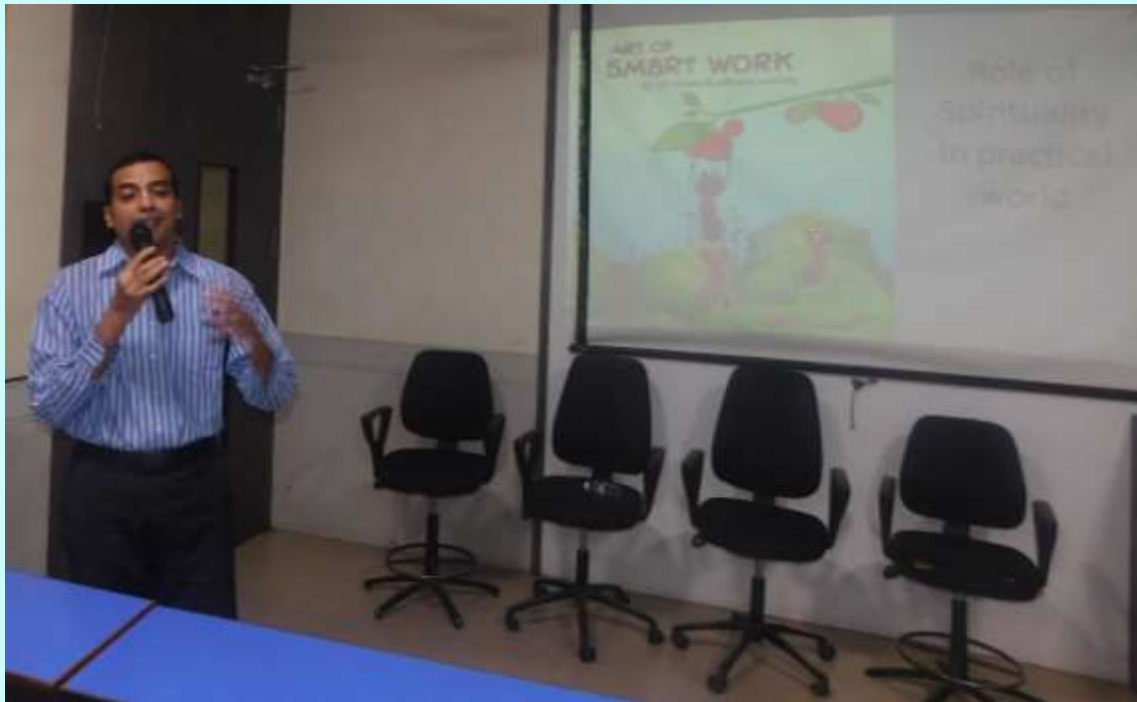
Motivational Session on "Role of Spirituality in Practical World"