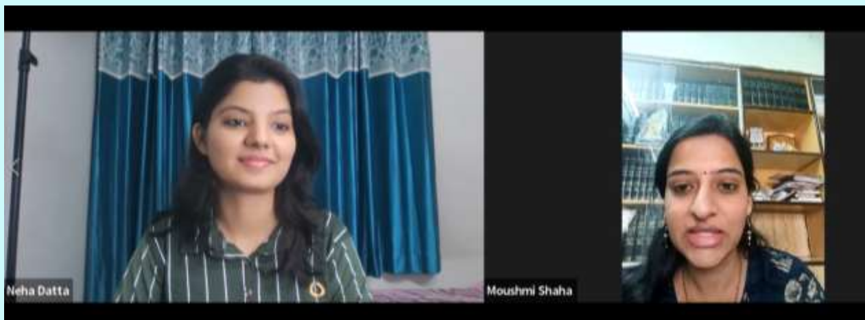
Webinar on Let's Face the Fear