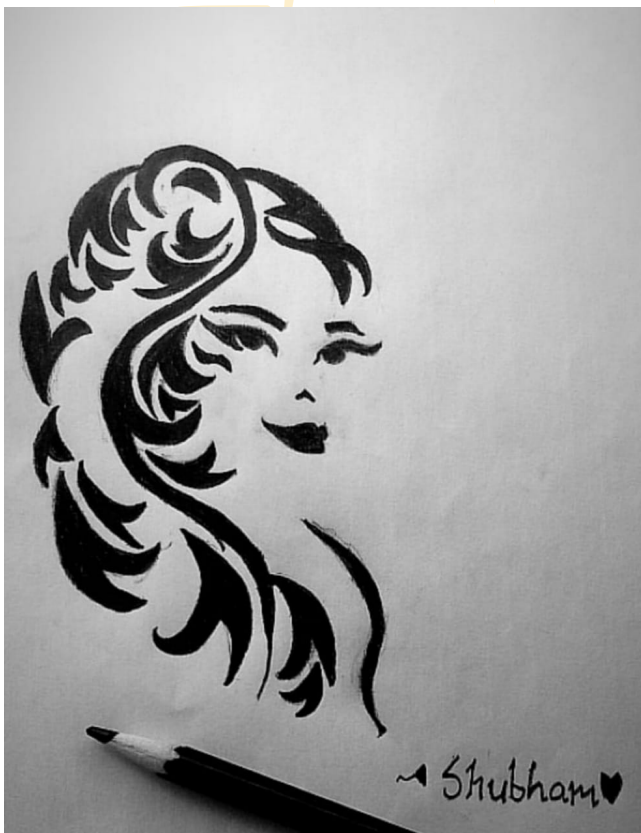
-Shubham Jagannath Dhoot (WR00557775)