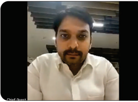
Dr. Vishwajeet Kadam Hon'ble State Minister for Cooperation Chief Guest

2 Days Refresher Course on "Cooperative"