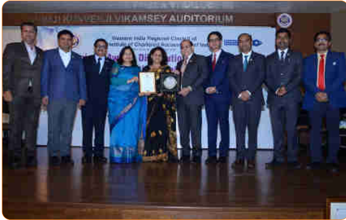
Best Branch at Regional Level - 1st Prize