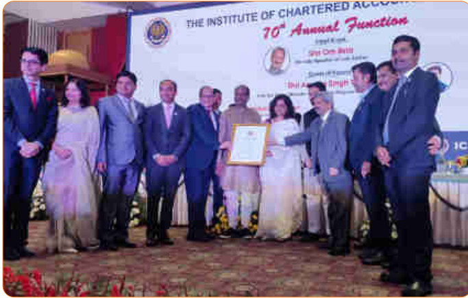
Best Branch at National Level - 1st Prize