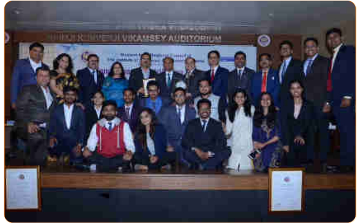
WICASA-Best Branch at Regional Level - 1st Prize