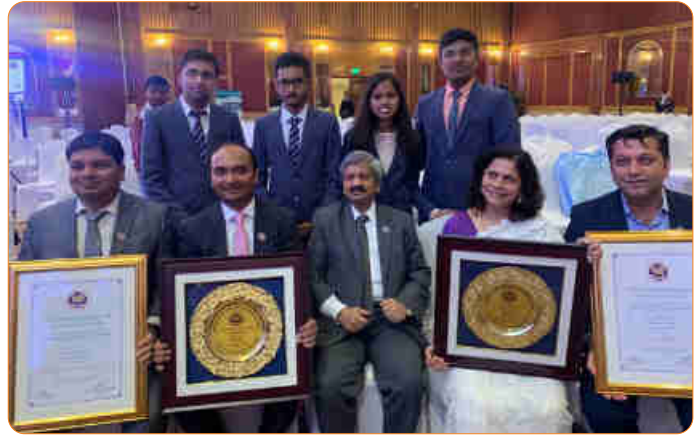
WICASA-Best Branch at National Level - 1st Prize