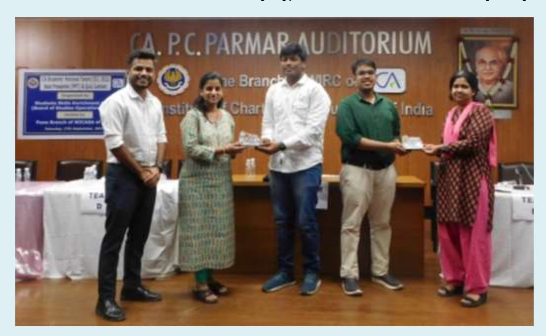
CA Students' National Talent (II), 2022 - Quiz Contest