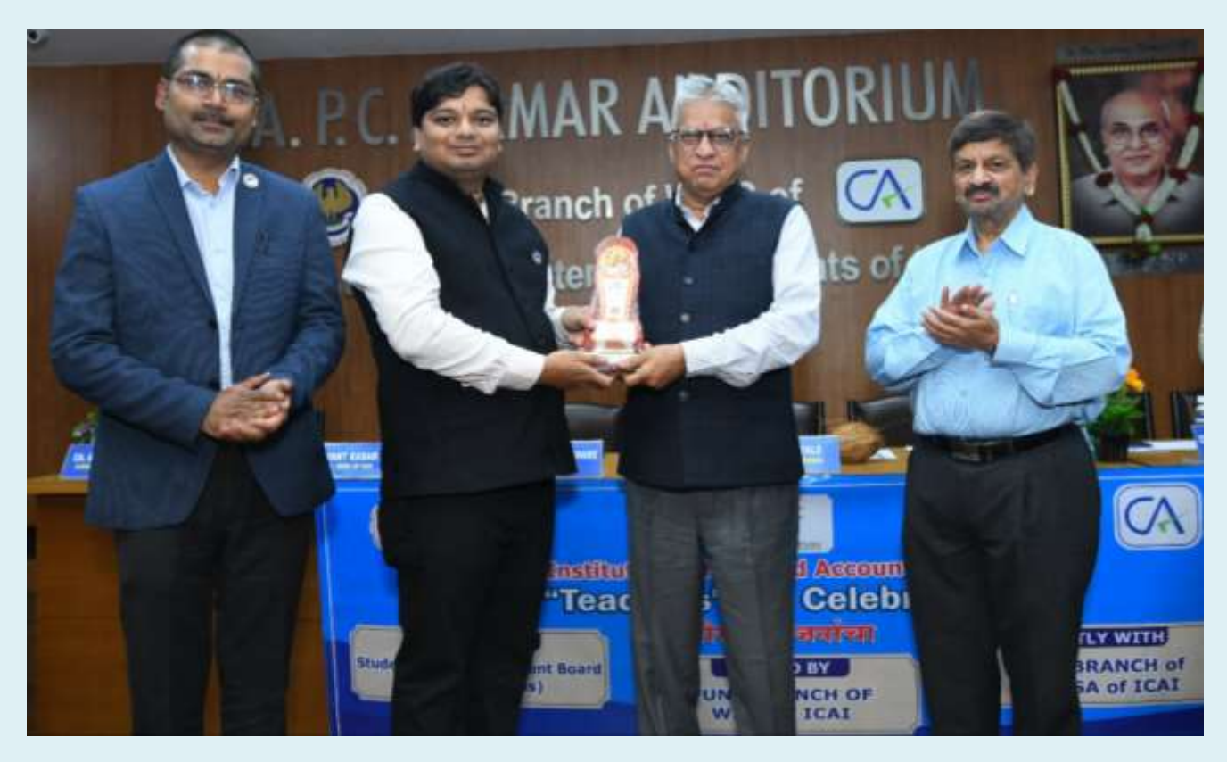
Teachers' Day Celebration "गौरव गुरू-जनांचा!!"