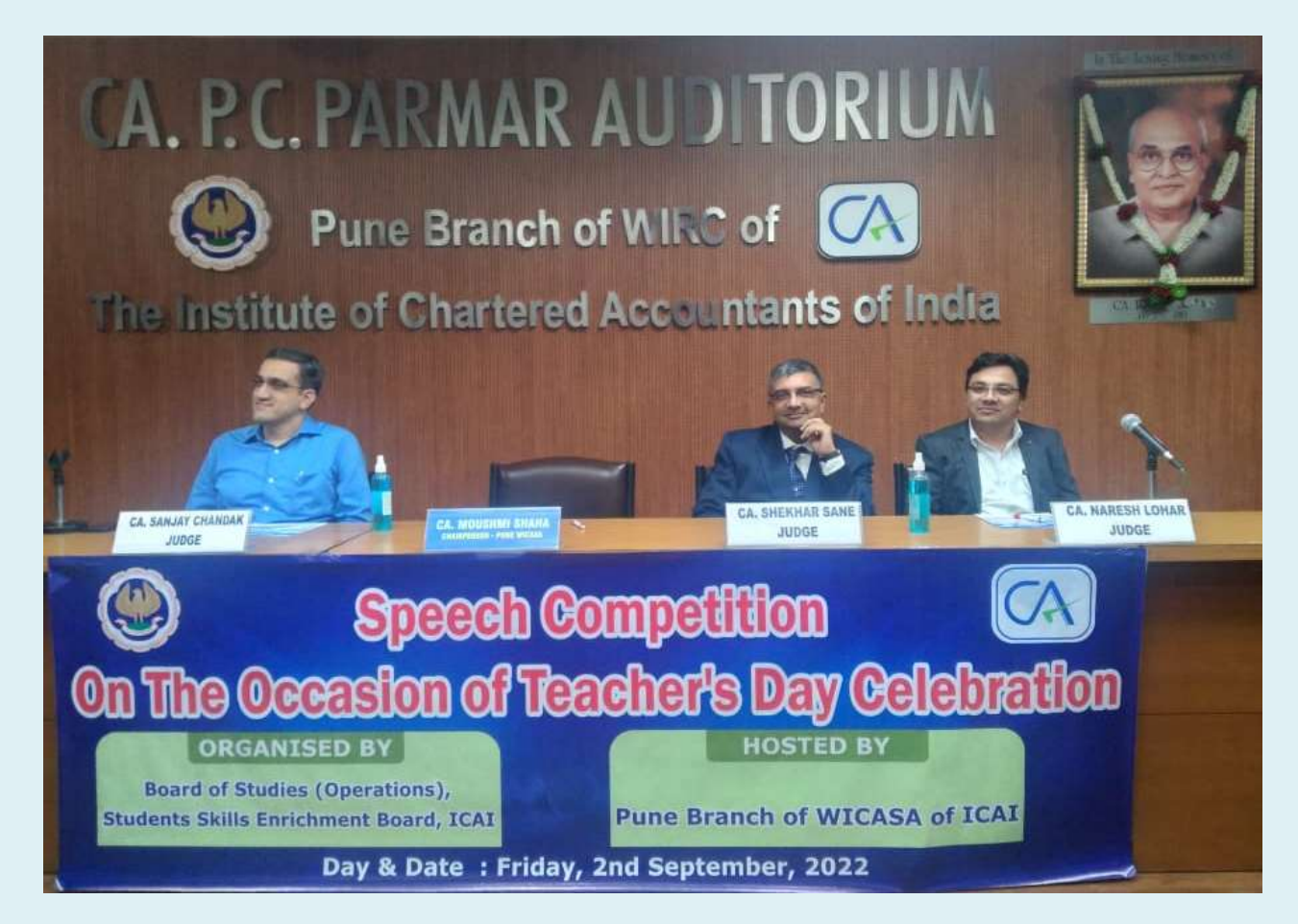
Speech Competition On The Occasion of Teachers' Day Celebration