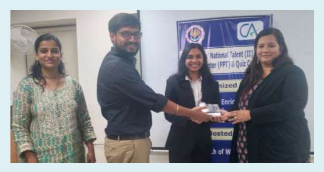
CA Students' National Talent (II), 2022 - Best Presenter (PPT)