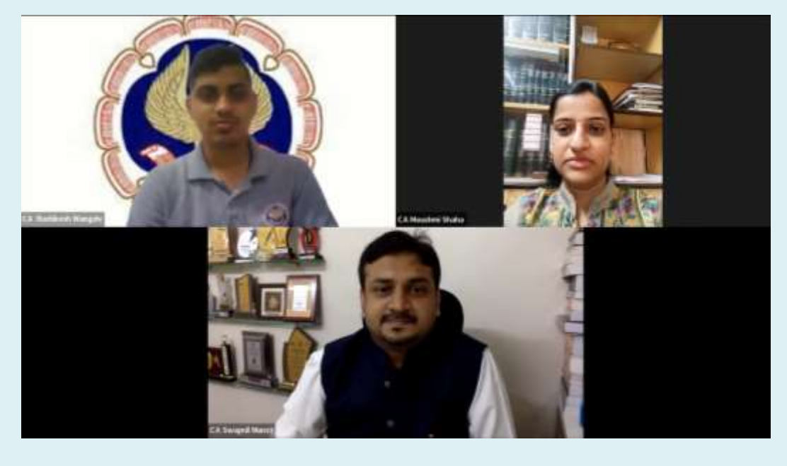
Webinar on "Changes in GSTR 3B and Recent Important Changes in GST" \,