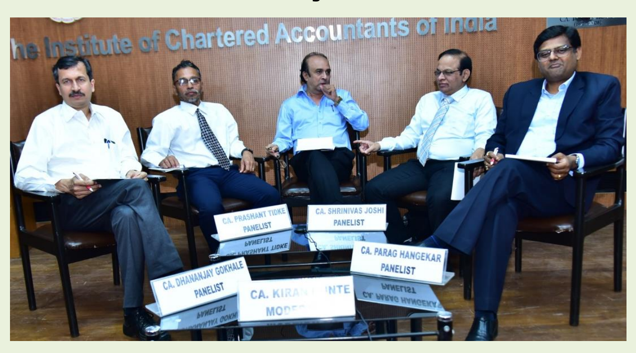
(Day 2) Panel discussion "Issues in Bank Branch Audits"