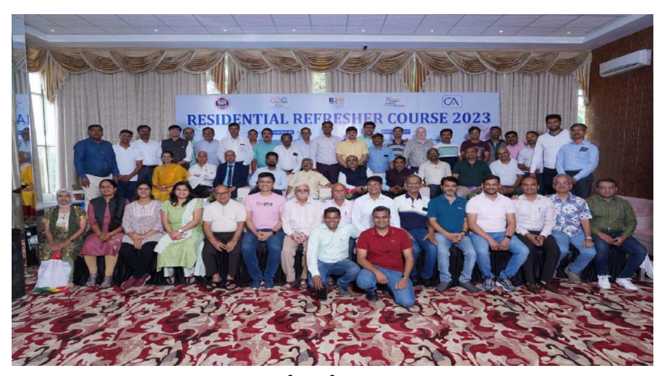
Residential Refresher Course (RRC) at Mahabaleshwar @ 25th & 26th June,2023