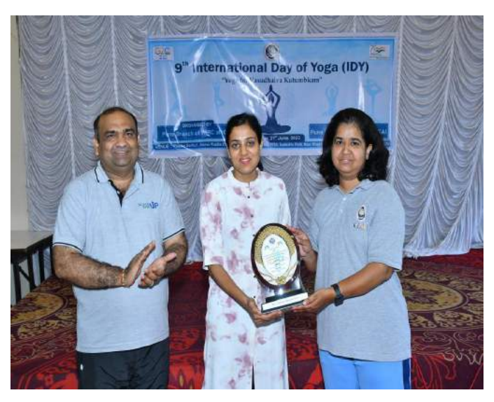
9th International Day of Yoga (IDY) - "Yoga for Vasudhaiva Kutumbkam"