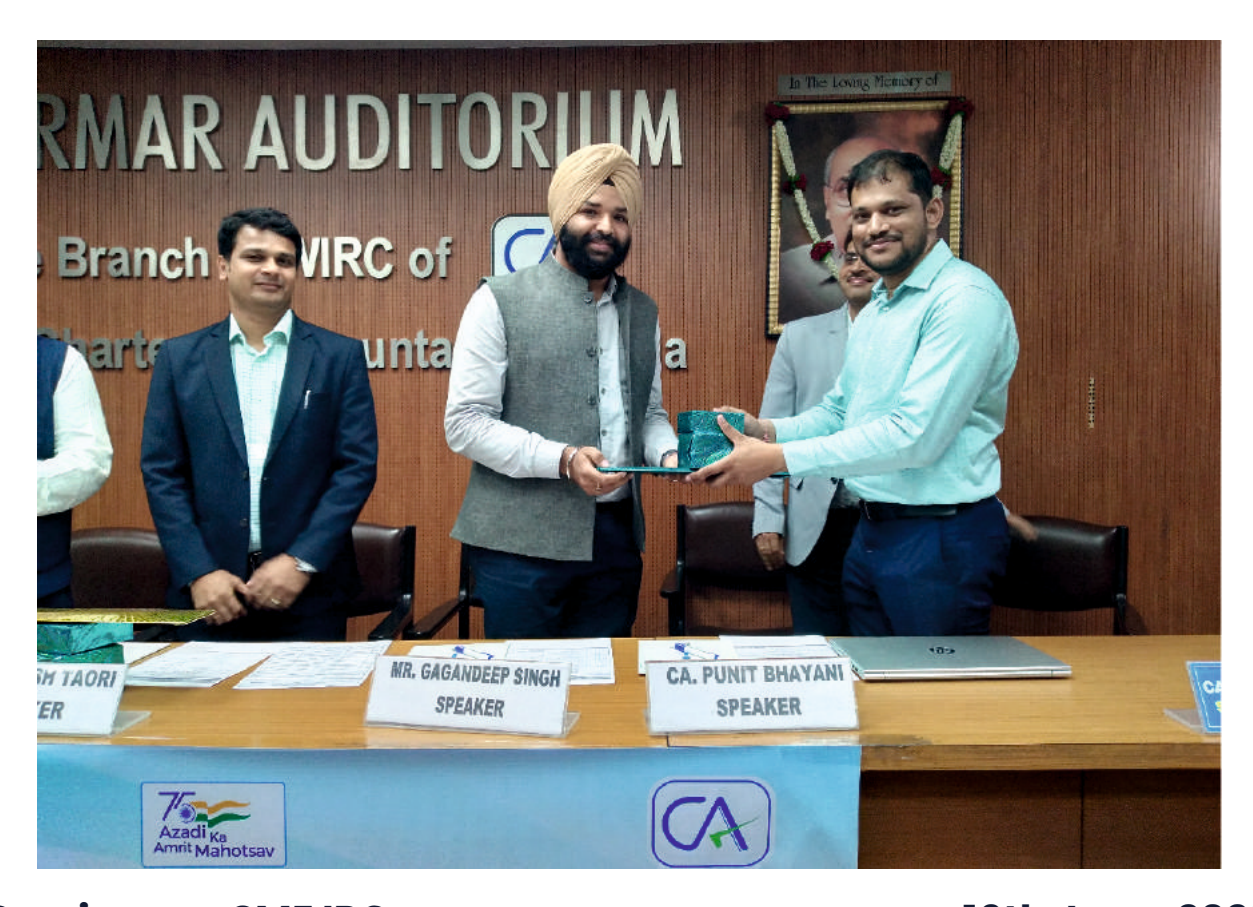
Seminar on SME IPO awareness programme on 16th June ,2023