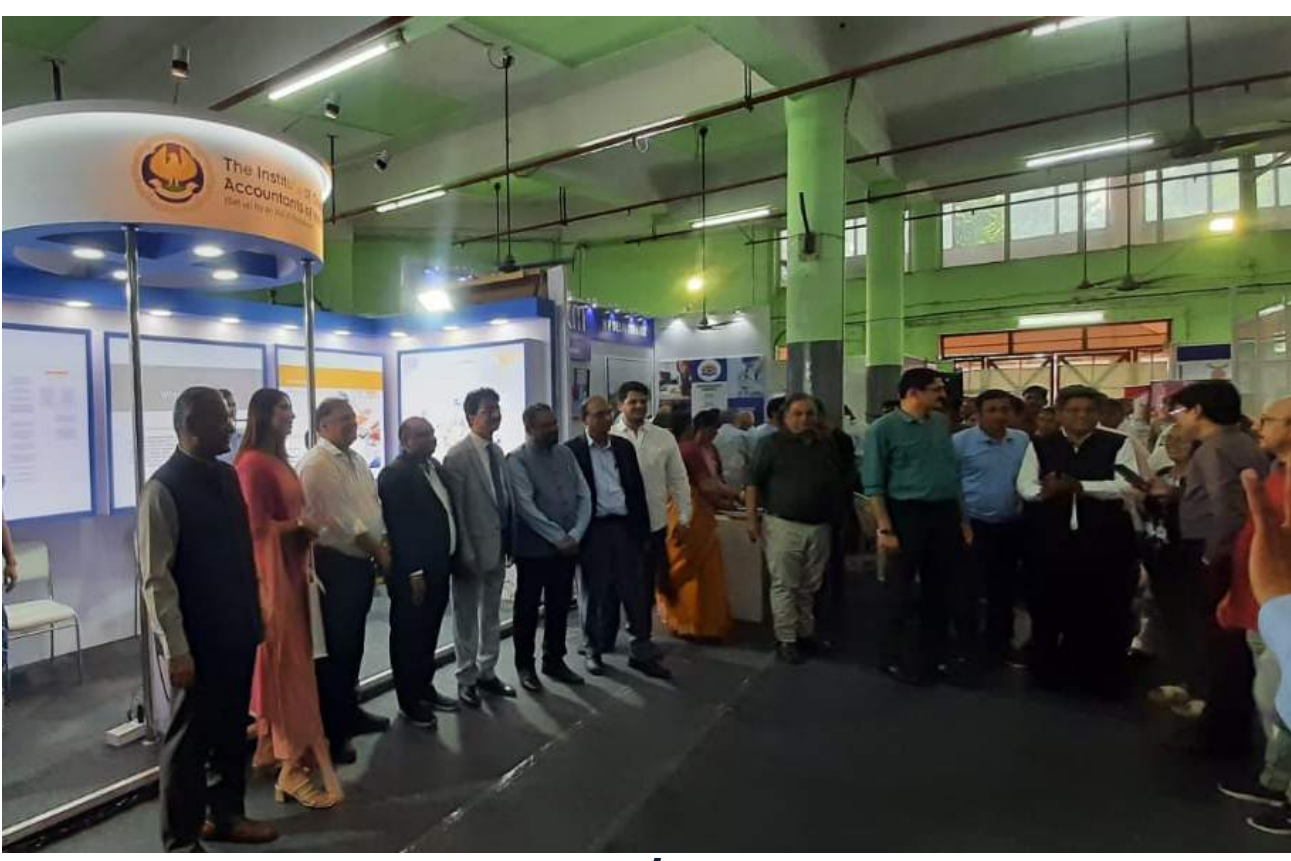
9th to 11th June, 2023 Career/Educational Fair Sakal Vidya Educational Expo-2023, Career/Educational Fair