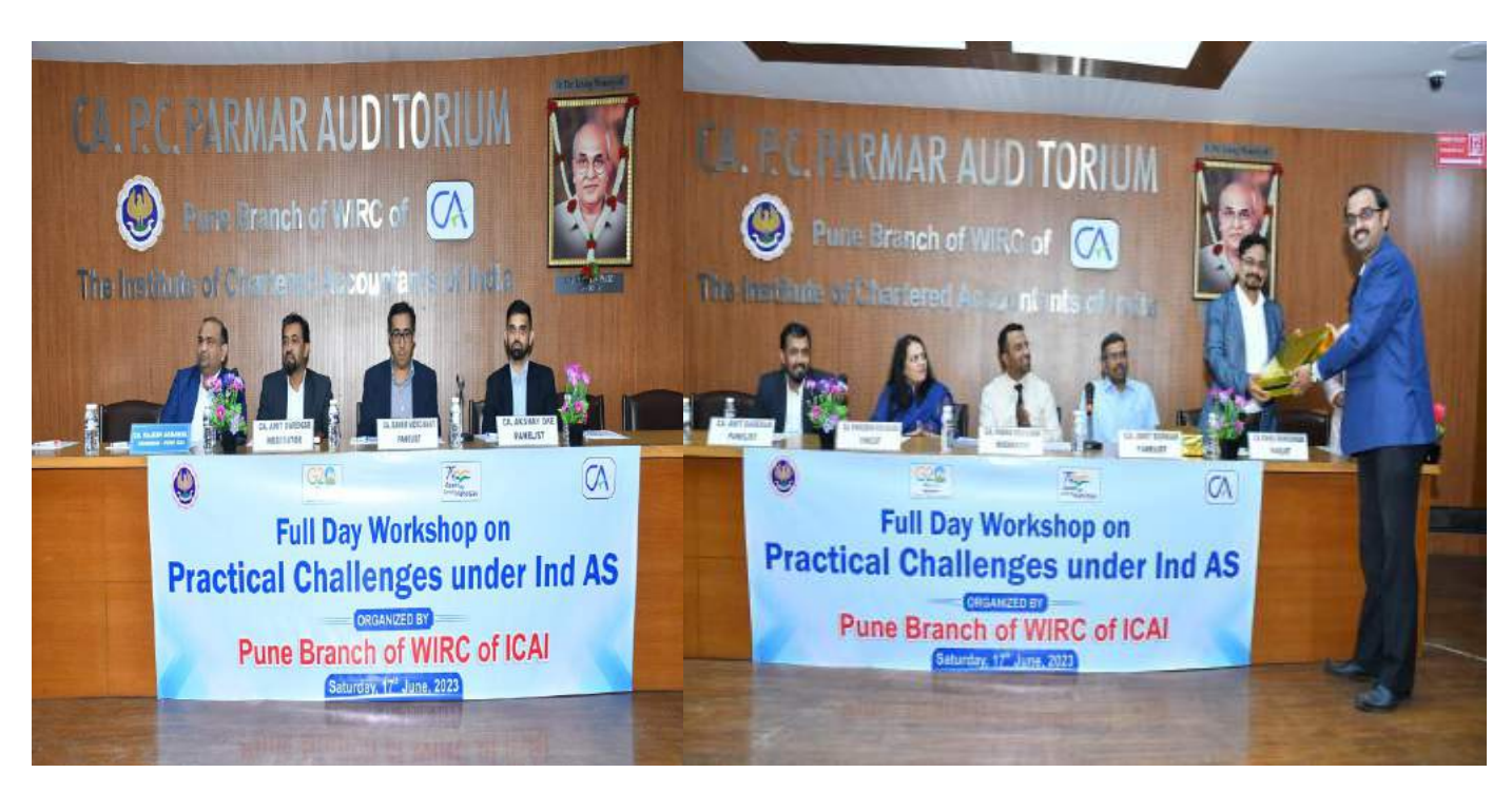
Seminar on Full Day Workshop on Practical Challenges under Ind AS on 17th June ,2023