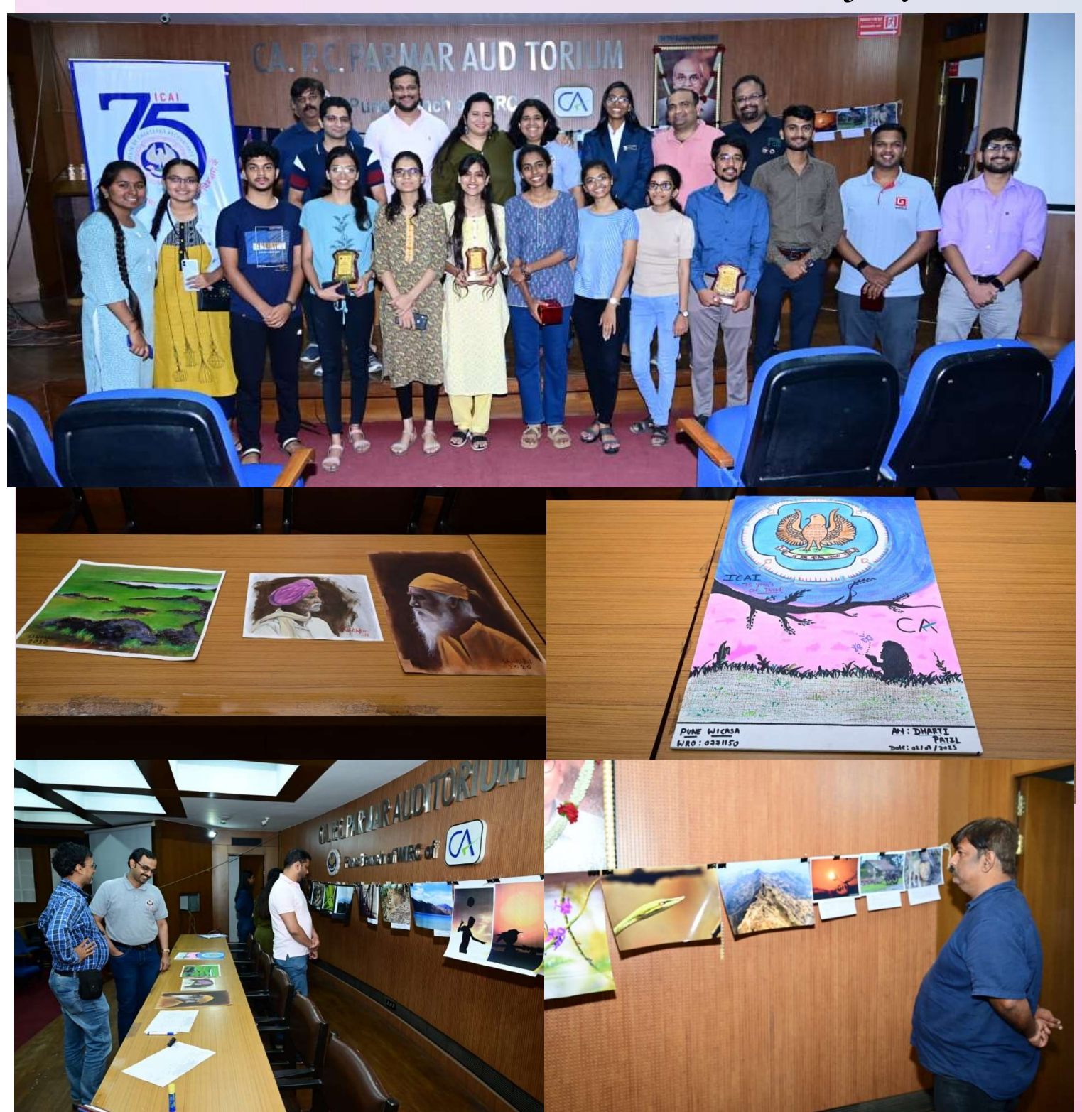
2<sup>nd</sup> July 2023