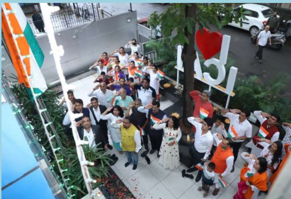
Flag hoisting on the occasion of 15 th August, 2022

For those who have their savings ready, it is a great time to invest in real estate as the prices are low.