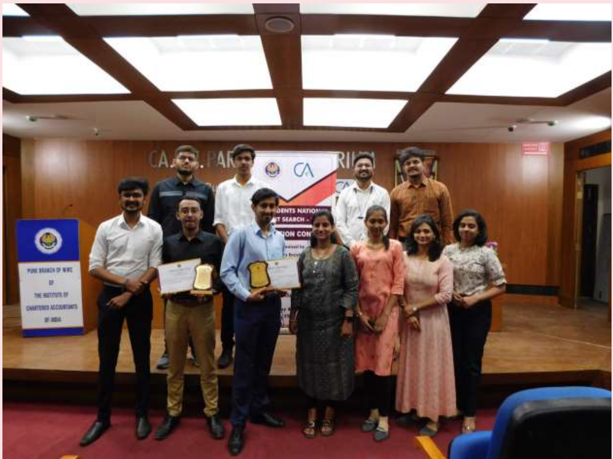
CA Students' Talent Search - Elocution Competition 2022 on 25 th April, 2022