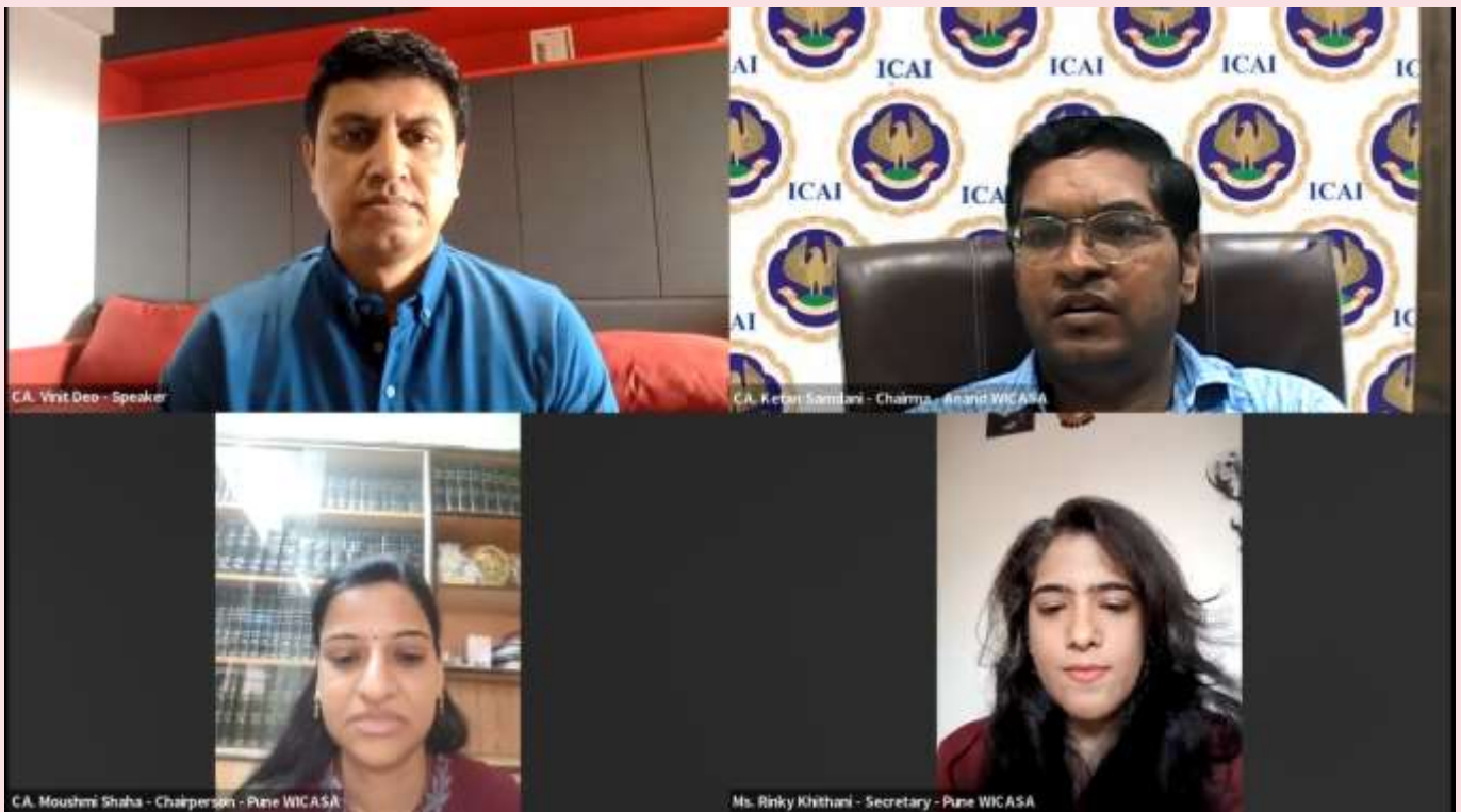
Emerging Opportunities for CA's on 18 th April, 2022