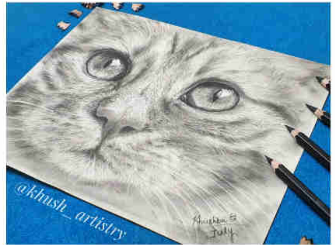
Bharati Kishor Biyani (WRO 0686651)