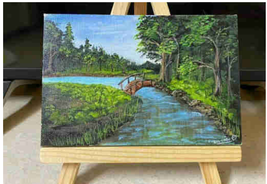
Khushbu Tarachand Desarda (WR00580713)