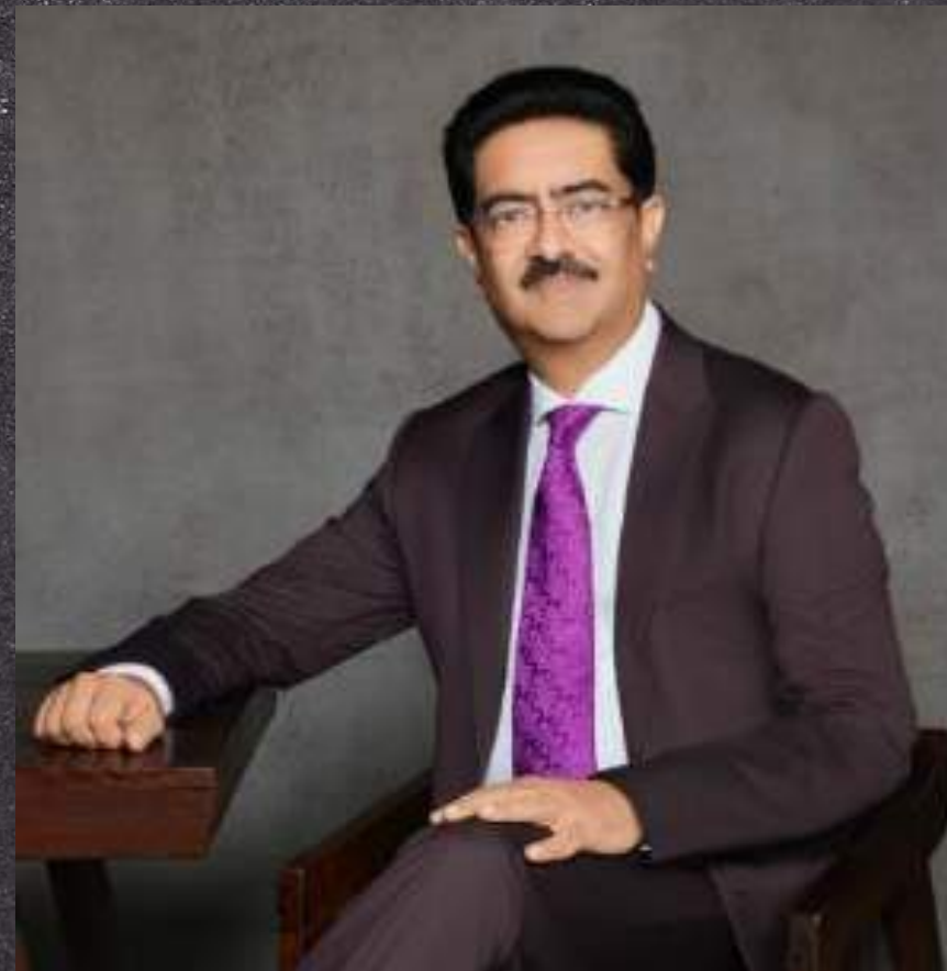
CA Kumar Mangalam Birla